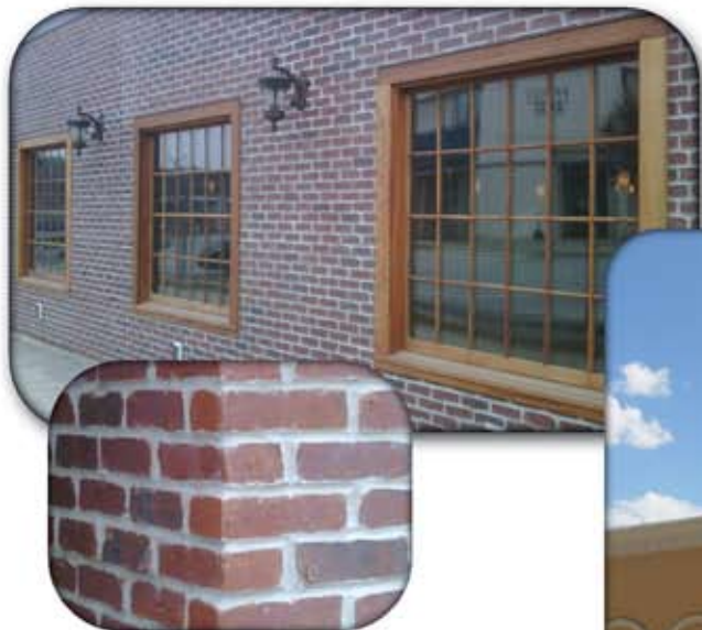
Commercial Connecticut Project (Kentucky Home)