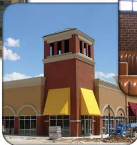
Cooper Street (Vineyard - No Black)