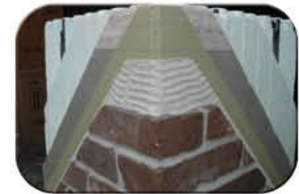
Lincoln Heritage w/ICF