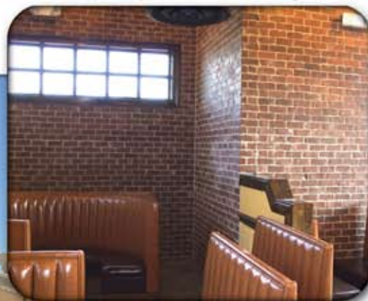
Zaxby's (Lincoln Heritage)

From enhancing a home's character to increasing the overall value, Clover Creek Brick Company's Tumbled Thin Bricks are an updated version of a classic brick original.