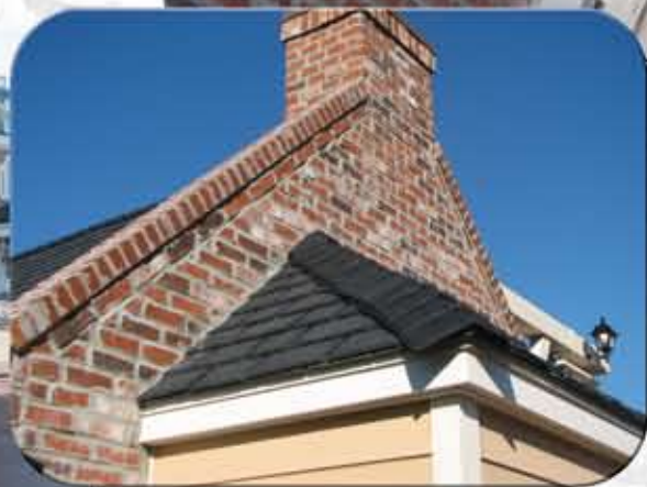
Epcot "Fire & Drum" Tavern